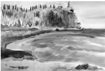
Centennial Sentry, watercolor, Mary Axelson

We'll explore landscape painting by focusing on separate elements, including abstract skies with silhouetted landscapes, then more specific skies, bodies of water, trees and rocks. In addition to brushes, we'll make natural forms with stencils, sponges, facial tissue, plastic wrap, and more. Experienced painters: please bring examples of your previous work to the first night's class. * A