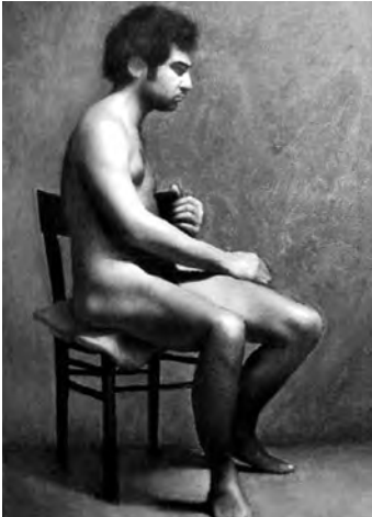
Figure Study. 1, oil, Jonathan Aller

Get 10% off your total registration when signing up for more than one class from this catalog!