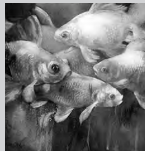
Goldfish 2002 No. 1 (detail)

Non-refundable deposit to secure space: $150