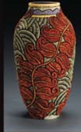
Deb Le Air